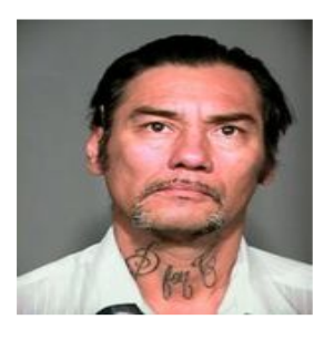
Charge/Offense Sexual battery.