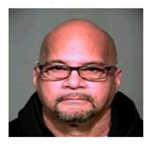
Charge/Offense Rape by force or fear.