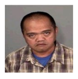
Charge/Offense Rape by force or fear.

Lewd or lascivious acts with a child under 14 years of age.