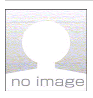
Charge/Offense Lewd or lascivious acts with a child under 14 years of age.