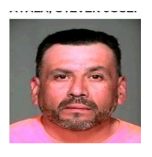
Charge/Offense Sodomy: person under 14.