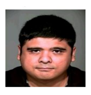
Offense Code CA18617208F7143

Oral copulation with a minor under 18 years of age.