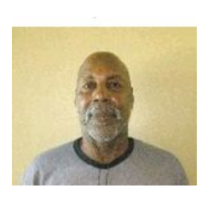
Charge/Offense Prior code: rape by force.

Possess or control obscene matter depicting minor in sexual conduct.