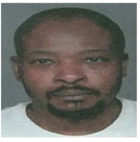
Charge/Offense Prior code: rape by force.