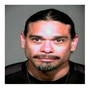
Charge/Offense Oral copulation by force or fear.